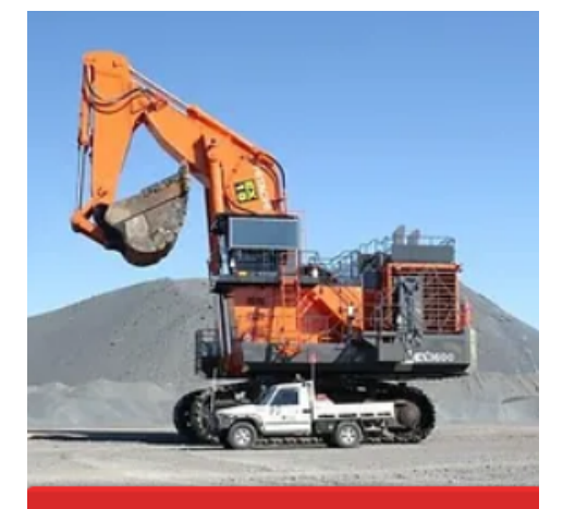
Plant and Machine Hire