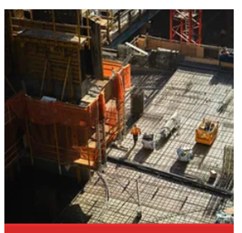
Delivering Construction Services